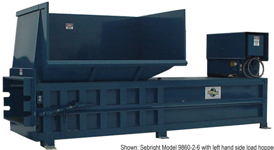
Shown: Sebright Model 9860-2-6 with left hand side load hopper, deck mounted power unit with cover, and optional pinning tunnel holes

Extra heavy duty frame and ram -- heavy structural plate with ship and car channel construction.